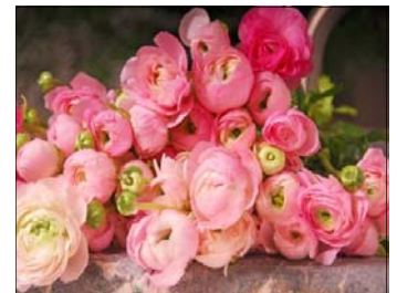
Ranunculus leaves, grass green and vaguely celery-like, grow on 12- to 18-inch stems emerge in March / June, July - they last up to six weeks in the garden.

unbridled beauty, from its tissue like petals that unfurl in tightly budded whorls to the breadth of colors in which it is found. As romantic as roses or peonies, but not nearly as commonplace, these bulb-grown blossoms work in tight, formal arrangements or when placed in a simple, clear vase-all the better to show off their curvy stems. Picotee ranunculus are particularly elegant, recalling the contrasting border of feathered cream ware or an antique book with gilt-trimmed pages. Once cut, ranunculus last up to a week,