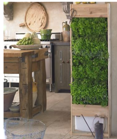
Vertical Kitchen Herb Garden

A wall may be left freestanding or mounted for added stability.