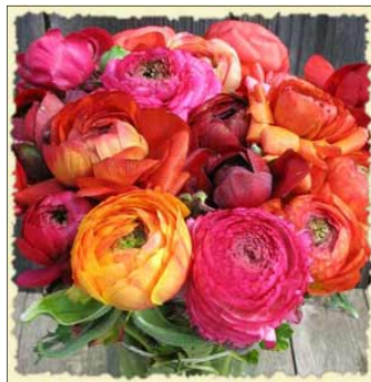
Remarkable for their many petals, ranunculus flowers make long lasting cut flowers

Know someone who is getting married? Have them check out our Wedding Gallery; www.hydrangeableu.com/wedding