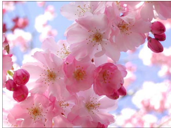
First Day of Spring!